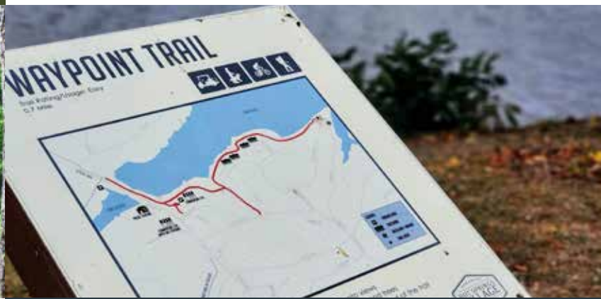
Golf Cart & Bicycle Use Trails include: Barcelona, Carmona, & Santa Maria