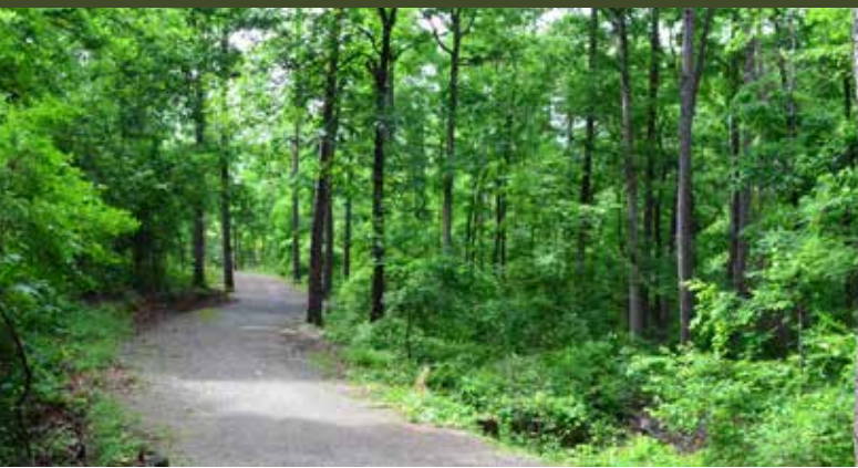
Also visit Sonora-Calella Trail at 209 DeSoto Boulevard, just 18 minutes from the Reunion Villas.